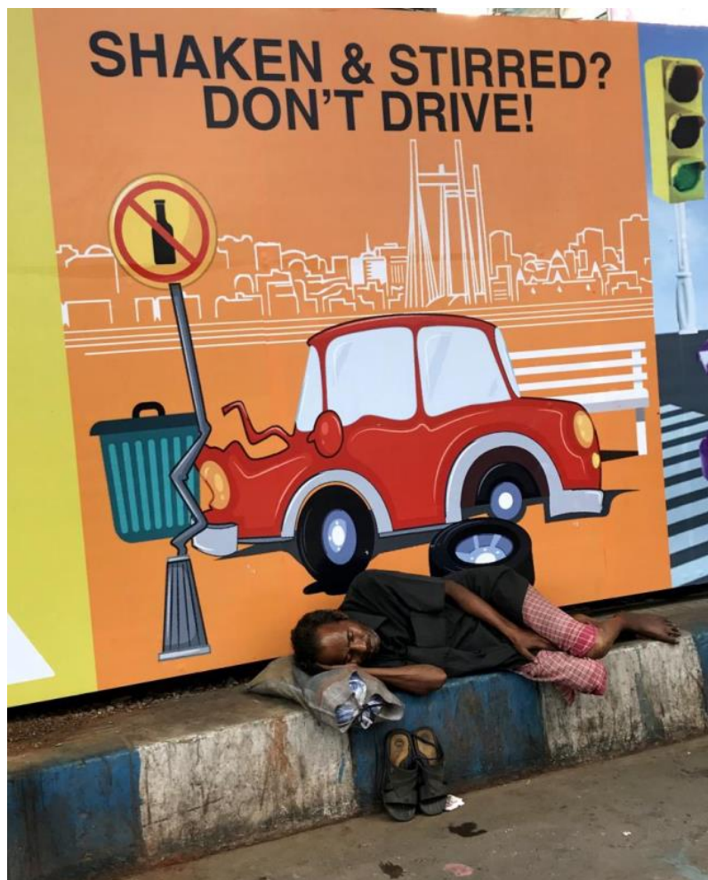
CERTIFICATE - SHAKEN AND STIRRED by SHOURJENDRA DATTA (KOLKATA)