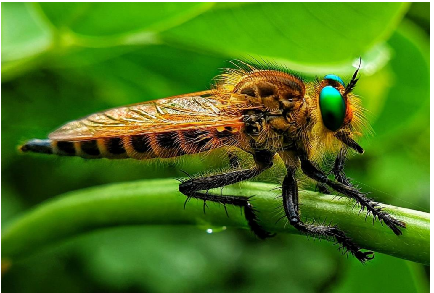
CERTIFICATE - 20200925_235222 by VIJAY VENUMUDDALA (HYDERABAD )