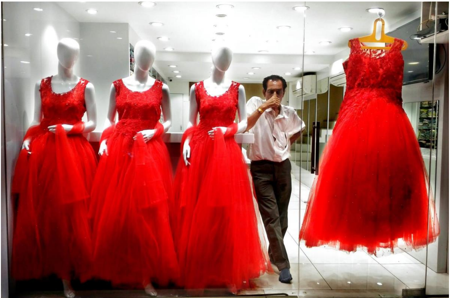
CERTIFICATE - REFLECTION OF RAID by DIMPAL PANCHOLI (VADODARA)