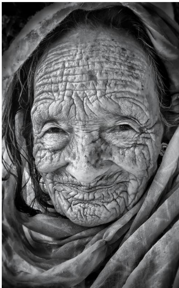
CERTIFICATE - SMILING WRINKLES by CHETAN KAPOOR (ALMORA)