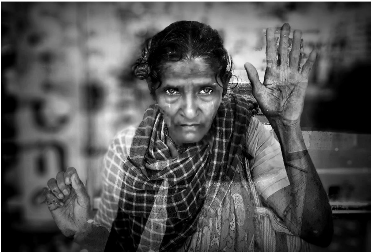
CERTIFICATE - NEVERTHELESS I by AKASH GHOSH (KOLKATA)