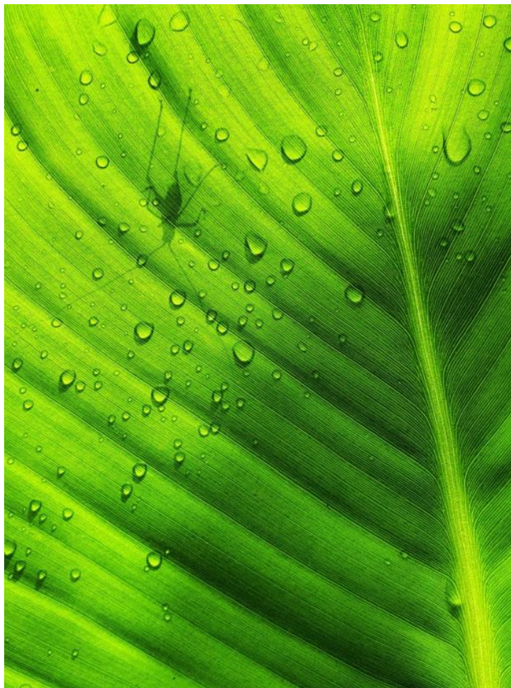
CERTIFICATE - BUG IN WONDERLAND by AKASH AKINWAR (MUMBAI )