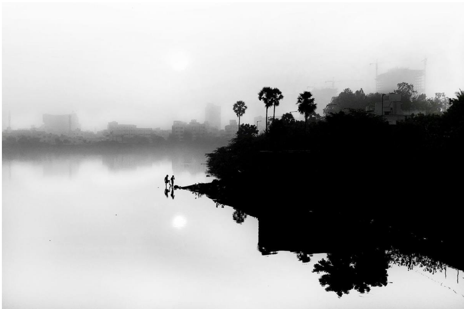
CERTIFICATE - CHENNAI WINTER by UDAYAN SANKAR PAL (CHENNAI)