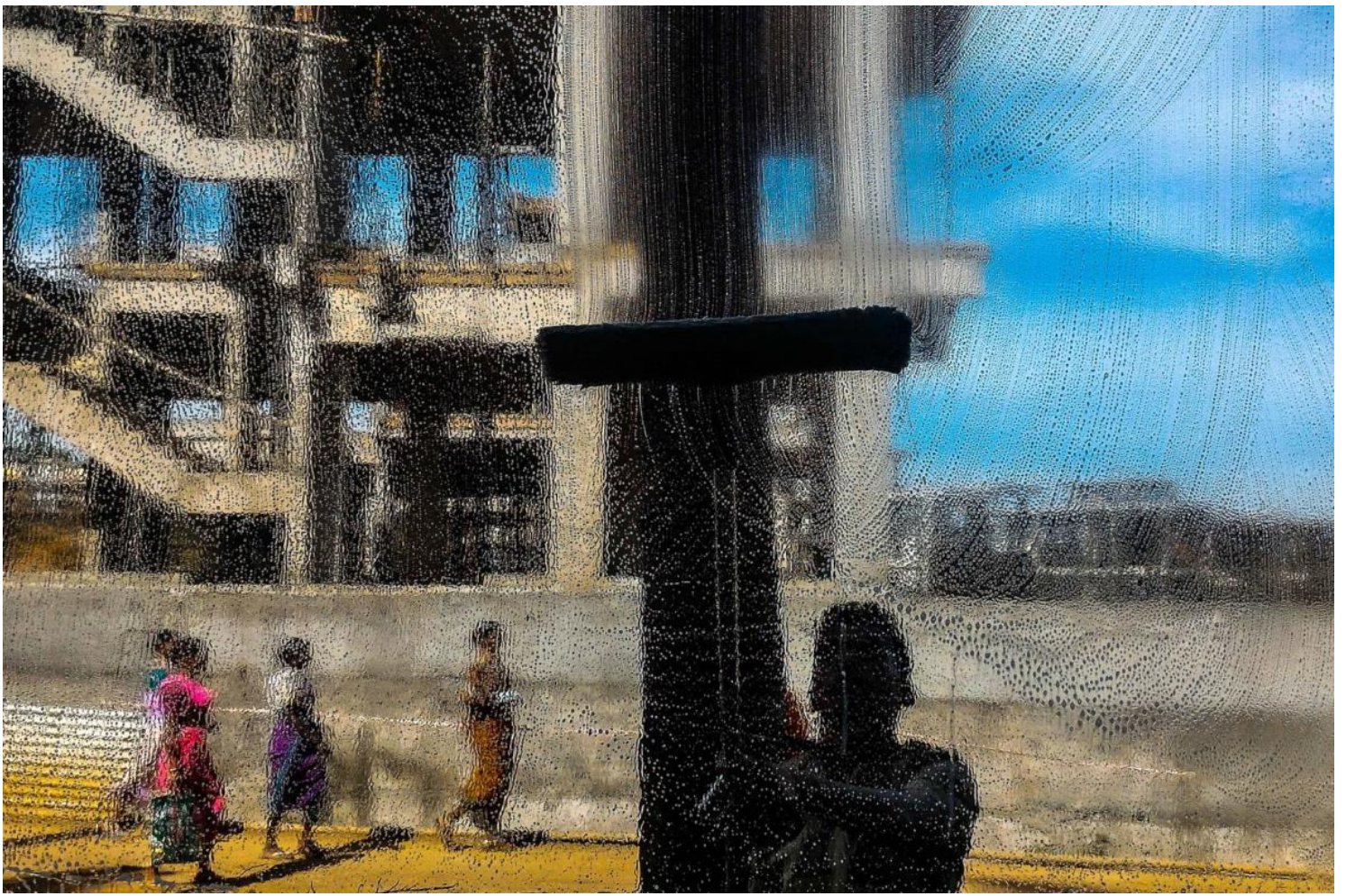
CERTIFICATE - GLASS PAINTING BY SOAP WATER by ABHISHEK PARDESHI (PUNE)