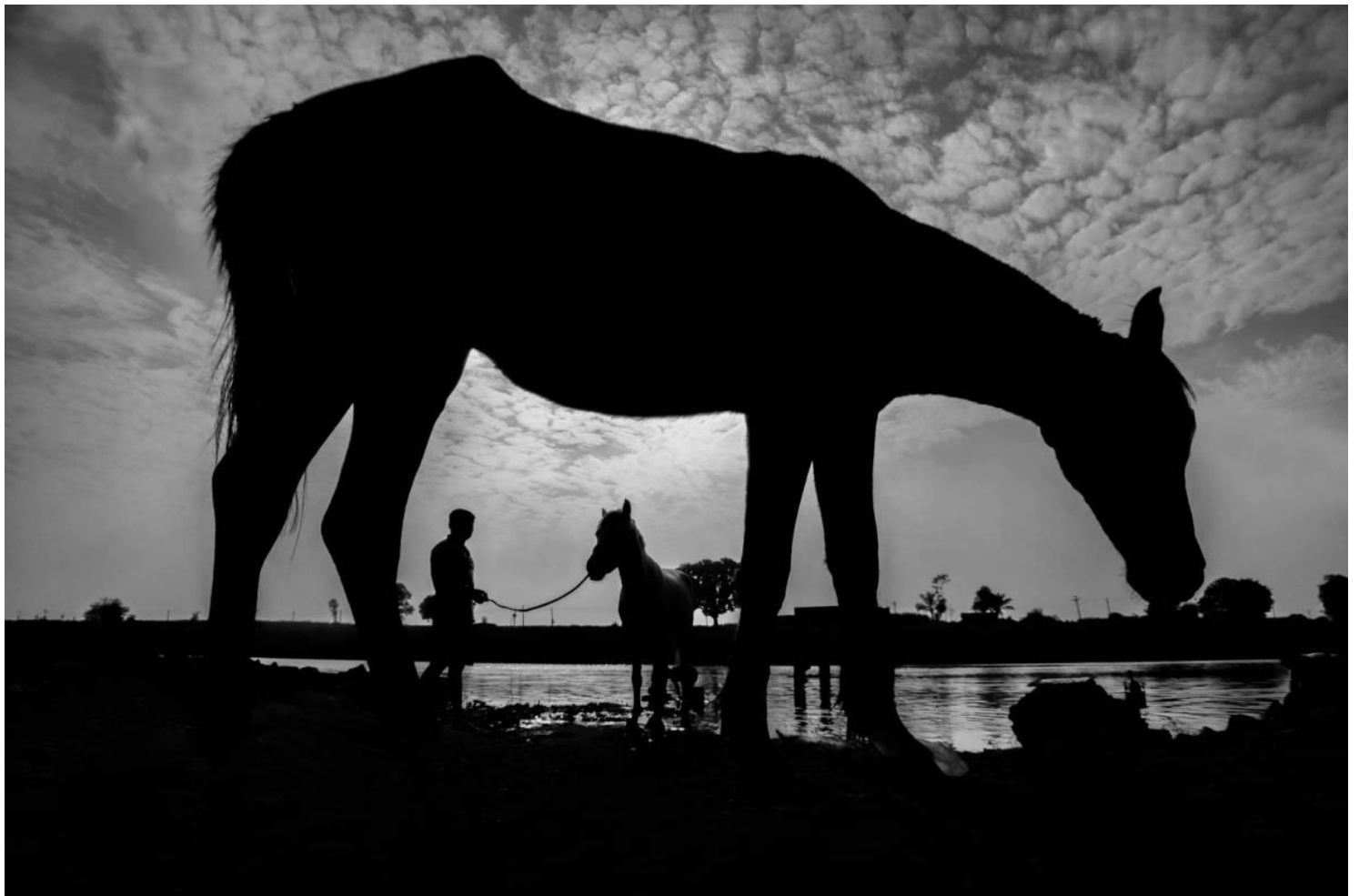
1ST CONSOLATION - TRAINING TIME by SHARAD PATIL (ICHALKARANJI)