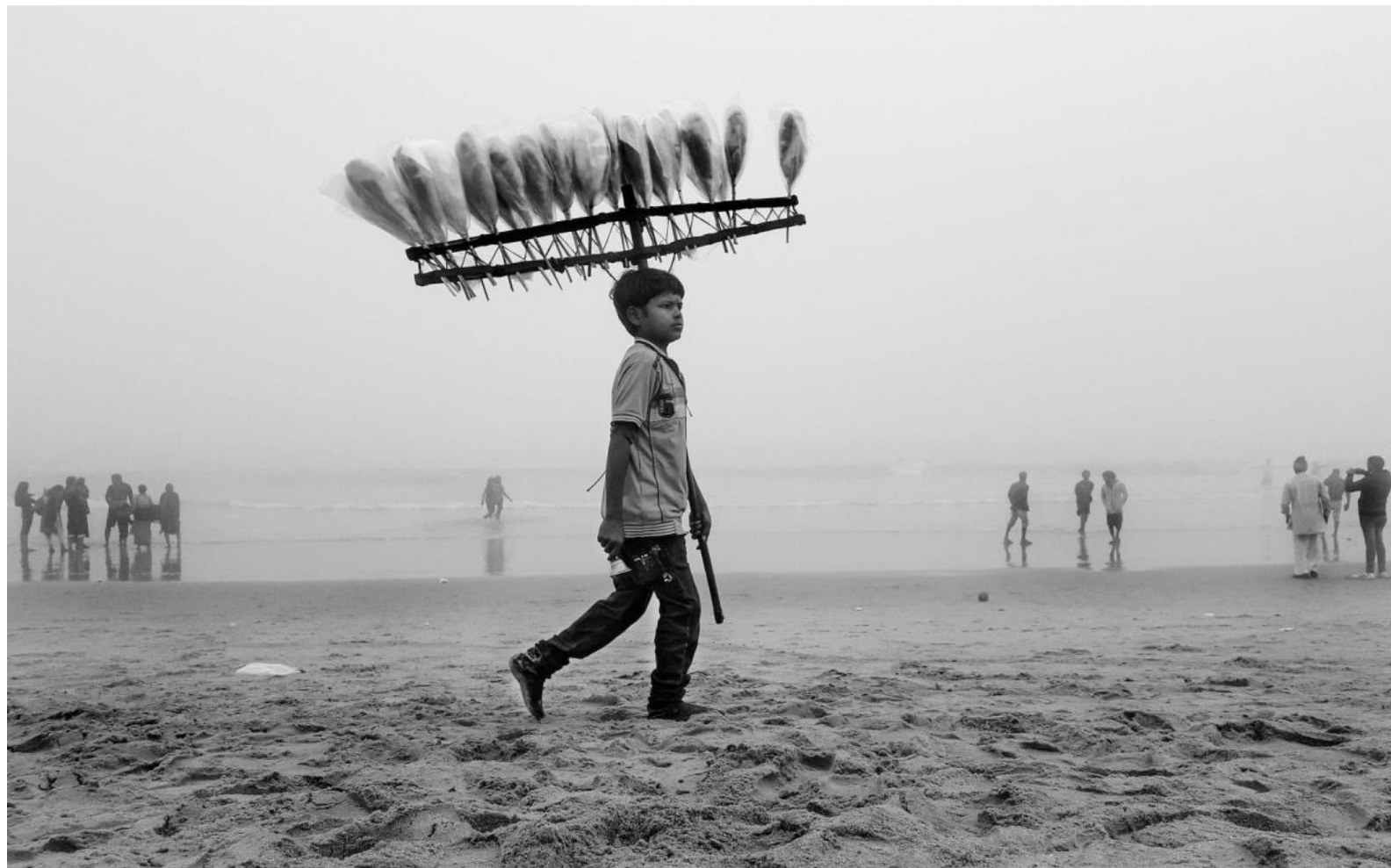
2ND CONSOLATION - COTTON CANDY SELLER by SUVAJIT MUKHERJEE (KOLKATA)