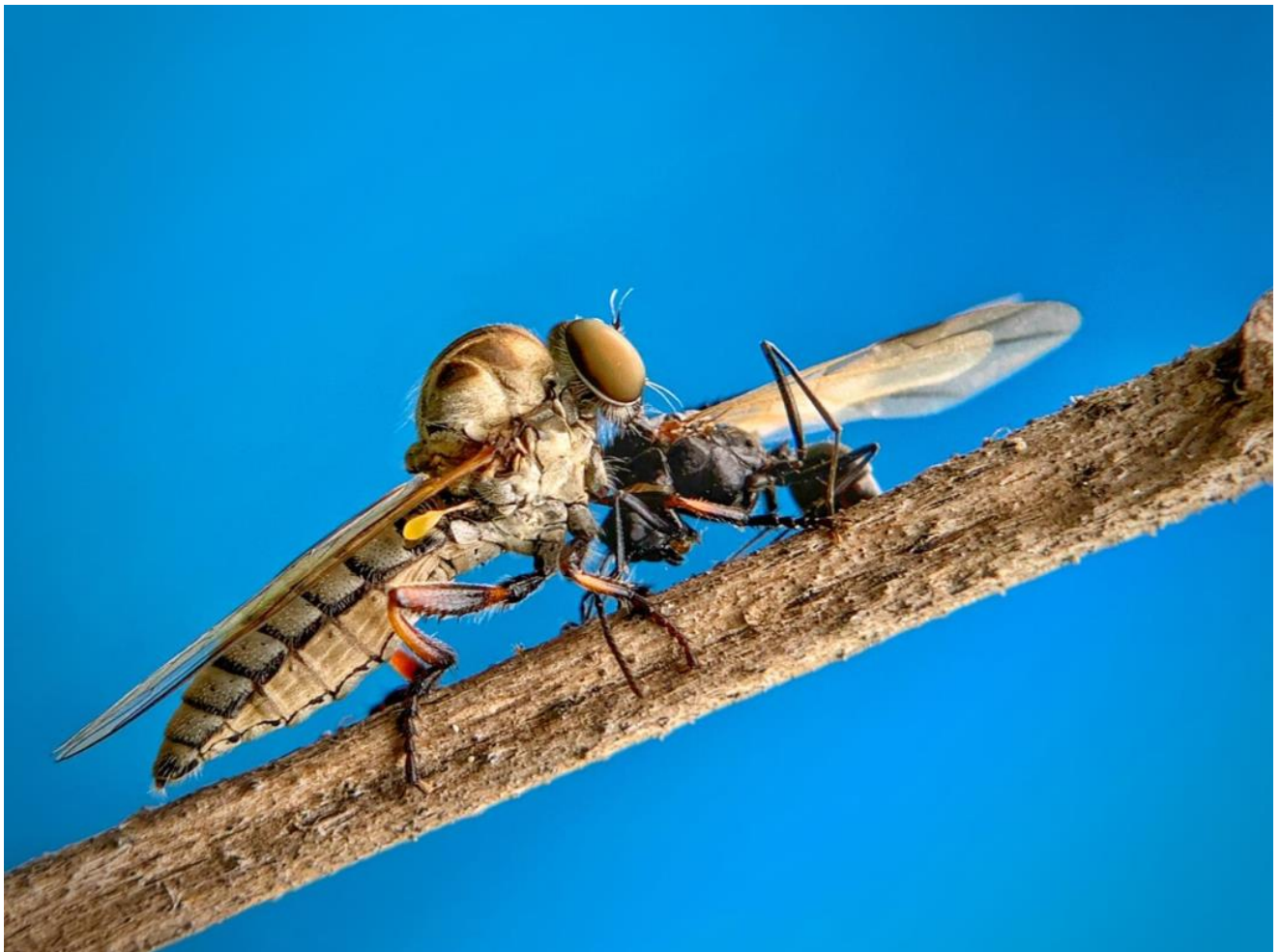
CERTIFICATE - IMG_0913 by LUCKY JAISWAL (PUNE)