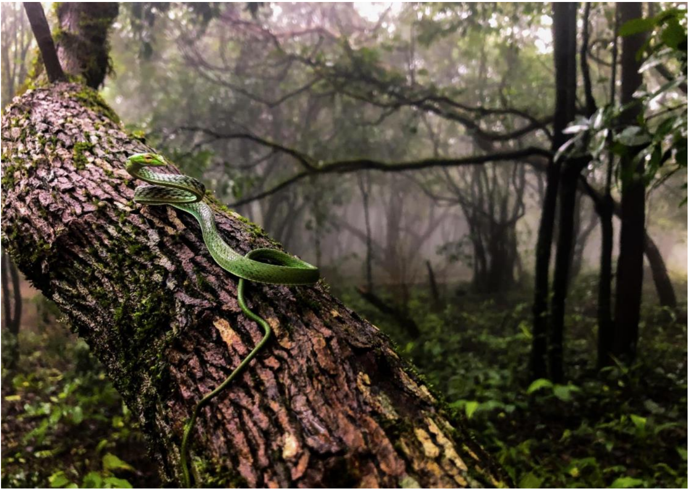
CERTIFICATE - VINE SURROUNDINGS by AMEYA BHAVE (THANE)