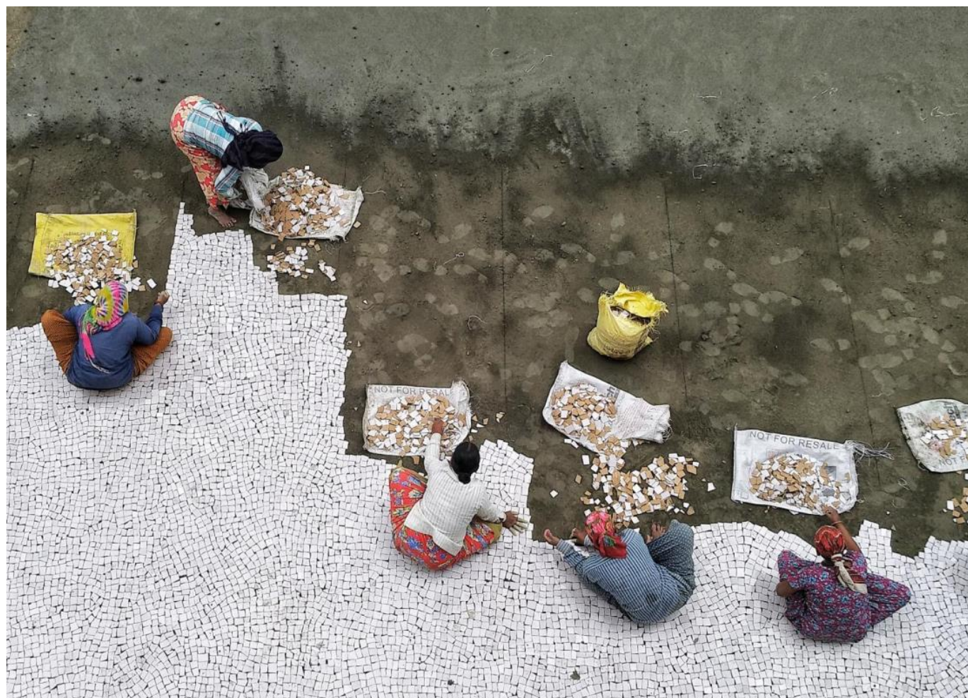
CERTIFICATE - WOMEN AT WORK by YASHODHAN NAVGHARE (MUMBAI)