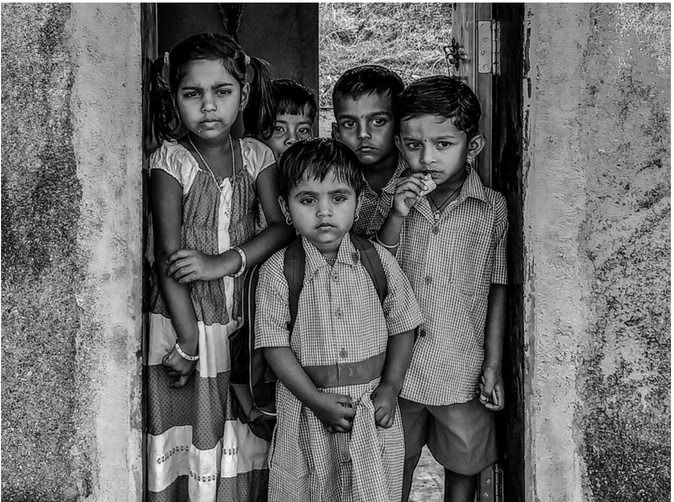
CERTIFICATE - INNOCENCE by SUYASH MHATRE (THANE)